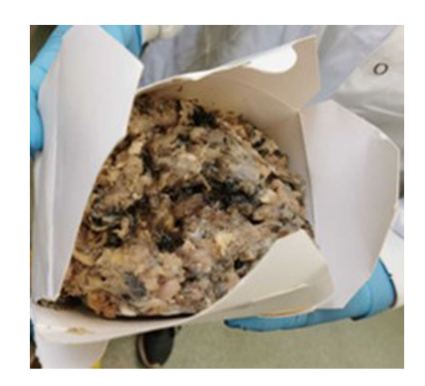
FIGURE 3 Disintegrated cardboard packaging following defrosting of a RMD sample.

Enumeration of E. coli and other Enterobacteriaceae was undertaken on 110 RMD samples and 24 NRMD samples from 10 brands each (Table 4, full enumeration results presented in Appendix Table A4). No bacteria were isolated from any of the NRMD samples.