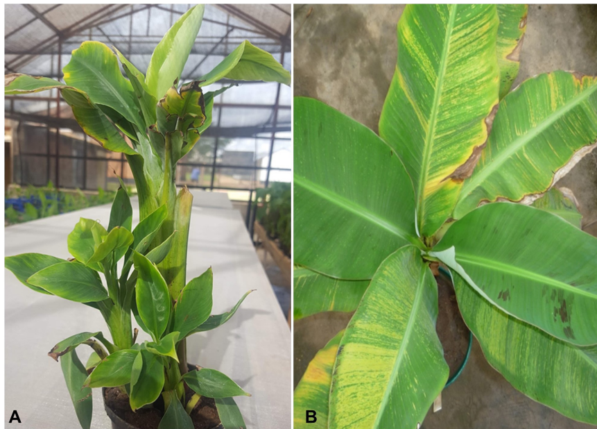
FIGURE 1 | Symptoms of viral diseases in infected banana plants. (A) Banana bunchy top virus (BBTV) infected plant showing stunting and bunchy leaves, (B) Banana streak virus (BSV) infected plant showing yellow streaks.