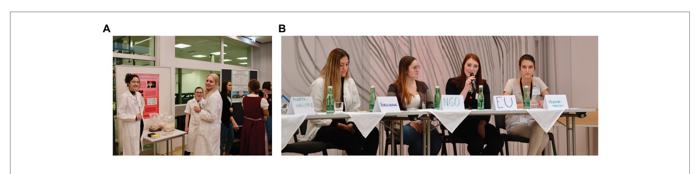
FIGURE 2 | Impressions of the poster presentations at the mini congress (A) and the panel discussion (B). (A) Three students in lab coats are waiting for visitors to present their poster about novel candidates for antibiotics and displaying on the desk bags and Petri dishes with different fungal cultures as a source of antibiotics. (B) Students vividly discussing the crucial factors of antibiotic (multi-)resistance in their respective roles (from left to right): a publicly-funded scientist, an activist of a non-governmental organization, a member of the European Commission, and a physician. Students representing the pharmaceutical industry, the agriculture, the World Health Organization, or the hosting journalist(s) are not depicted in the photograph. For the students' experiences in the respective roles, see Results section; Table 3.