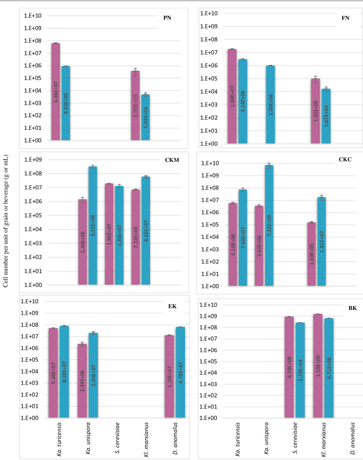
FIGURE 3 | Number of each five yeast species per g or mL of kefir grain (red bar) or beverage fraction (blue bar) of six milk kefirs. Numbers represent the mean of triplicate measurements. Error bars represent the standard deviation (SD).