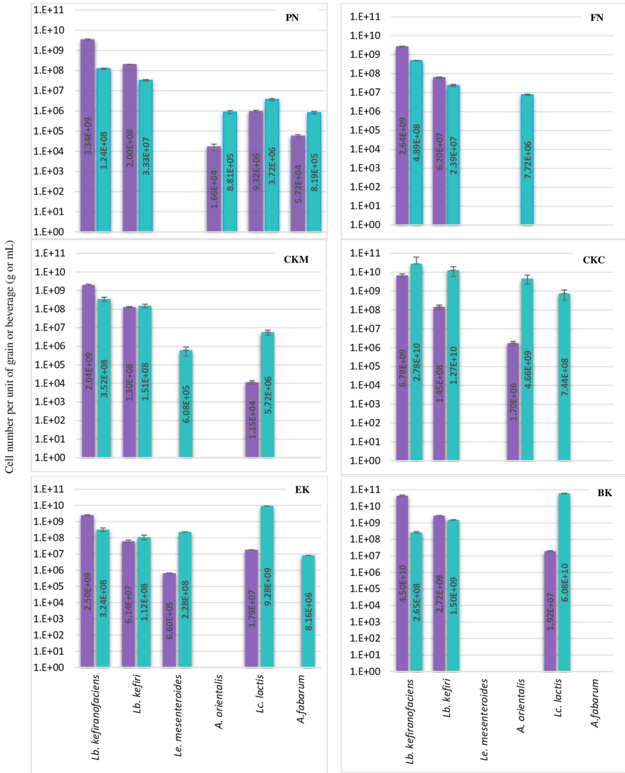
FIGURE 2 | Number of each six bacteria species per g or mL of kefir grain (purple bar) or beverage fraction (green bar) of six milk kefirs. Numbers represent the mean of triplicate measurements. Error bars represent the standard deviation (SD).