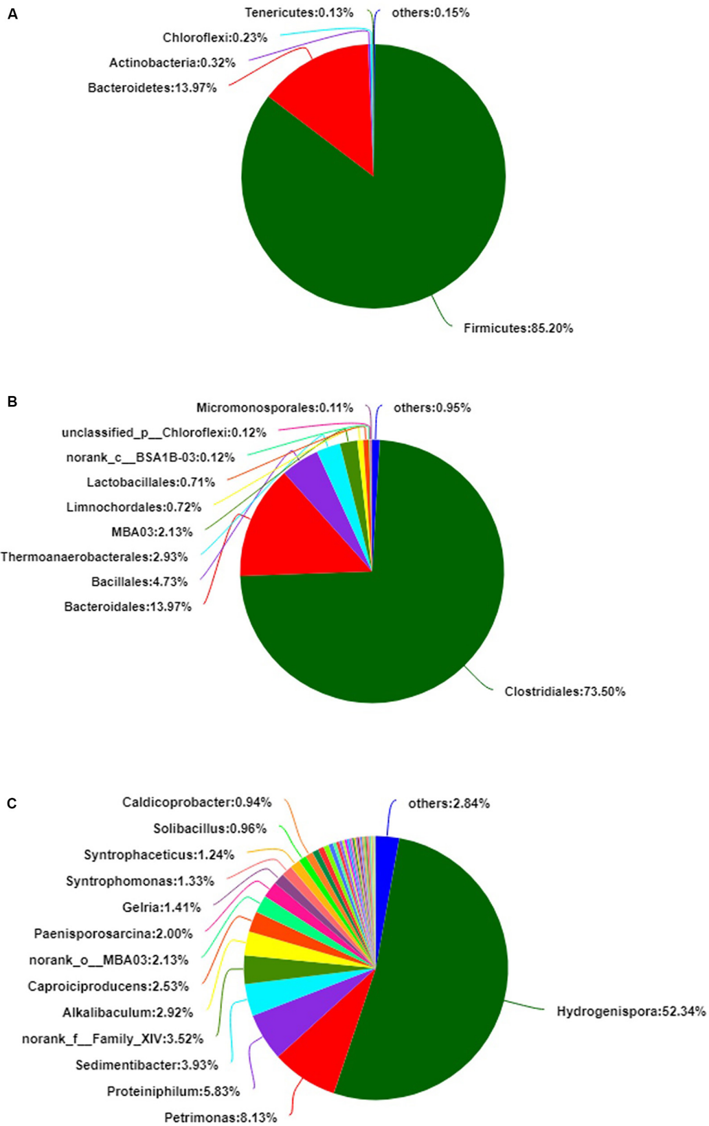
FIGURE 1 | The relative abundance of bacteria in pit mud (PM). (A) Phylum level. (B) Order level. (C) Genus level.