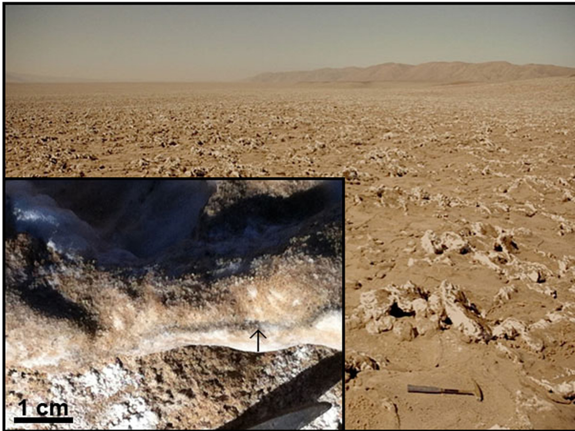
FIGURE 1 | Yungay Salar, an analog environment for Mars. The insert on the lower left shows a salt crust populated by microorganisms using salt deliquescence for getting access to water. The dark band (arrow) within the salt crust is the pigment scytonemin.

encountered in space. Fredrickson et al. (2008) argued that the UV and ionizing radiation resistance of soil bacteria is an incidental mechanism evolved to prevent oxidative protein damage induced during cycles of drying and rehydration, since most of the soil bacteria are shielded from such radiation by overlying soil. Surprisingly though, hyperthermophilic archaea recovered, e.g., from submarine hydrothermal vents have been found to withstand radiation levels of nearly 8,000 Gy (Jolivet et al., 2004; Beblo et al., 2011). Some multicellular organisms are also quite resistant to radiation such as the tardigrade Ramazzottius varieornatus . In its desiccated anhydrobiotic state it shows a high resistance to UVC (100–280 nm) (Horikawa et al., 2013), and the cockroach Blattella germanica can survive levels of ionizing radiation close to 1,000 Gy (Schulze-Makuch and Seckbach, 2013). Organisms limit radiation damage by a variety of microbial protection mechanisms. These include avoidance behavior, excision repair, photorepair, homologous recombinational repair, as well as the production of detoxifying enzymes and antioxidants (Yasui and McCready, 1998; Petit and Sancar, 1999; Rothschild, 1999; Smith, 2004). Other options for organisms to protect themselves from UV irradiation are habitation beneath protective layers of water or soil (Pierson et al., 1987; Wynn-Williams and Edwards, 2000), the development of iron-enriched silica crusts (Phoenix et al., 2001), self-shading