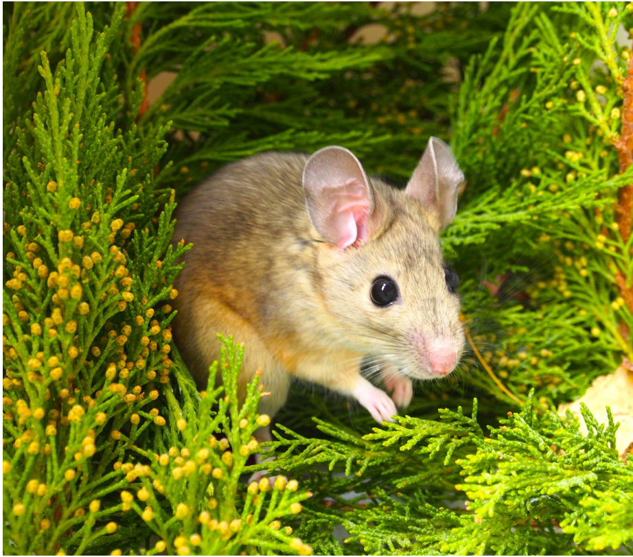
FIGURE 1 | A desert woodrat ( Neotoma lepida ) surrounded by terpene-rich juniper.

(Kohl et al., 2014c). Thus, in this experiment there appeared to be permanent loss of some microbial members. Provision of the woodrats' natural diets upon entrance to captivity may be critical in maintaining the natural gut flora compared with a reintroduction of the diet at a later time. It would be interesting to compare the effects of captivity per se on the gut microbial communities of woodrats by examining the microbiota of woodrats fed their natural diets upon entrance into captivity compared to those immediately fed laboratory diets.