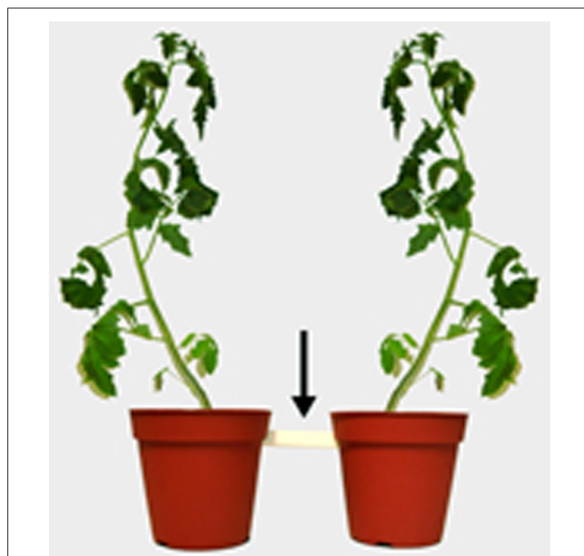
FIGURE 3 | Visualization of the experimental set-up of a twin-chamber with tomato plants used by Dababat and Sikora (2007) and Vos et al. (2012b) to study the differential attraction of Meloidogyne incognita to mycorrhizal roots. The two plant compartments are connected by a bridge. The experiment consisted of three treatments: (i) control plants in both compartments (control treatment), (ii) mycorrhizal plants in both compartments (AMF treatment) and (iii) a control plant in the left compartment and a mycorrhizal plant in the right compartment (mixed treatment). Two days after transplanting, the compartments and bridge were watered to field capacity at time of inoculation and 2,000 freshly hatched M. incognita 2nd-stage juveniles were inoculated per twin chamber, exactly in the middle of the bridge. Twelve days after inoculation, nematode penetration was assessed in control and mycorrhizal root systems of all treatments.

biosynthesis of a lignin precursor and 1-aminocyclopropane-1-carboxylate oxidase (ACC oxidase), catalyzing the final step in the biosynthesis of ethylene and related to the jasmonate-ethylene dependency of ISR (Verhagen et al., 2004; Schäfer et al., 2009). These transcriptome data point toward several candidate genes by which AMF can exert biocontrol against PPN through priming of effective plant defenses. However, future research should focus on the elucidation of their specific action toward PPN, with emphasis on the proteome and metabolome AMF-associated changes.