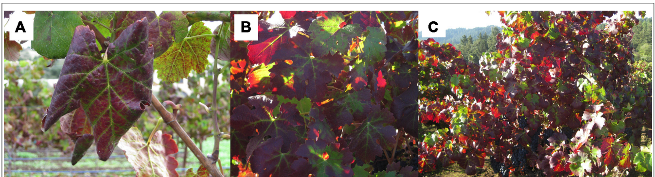
FIGURE 1 | Leaf symptoms of grapevine leafroll disease include inter-veinal reddening and leafrolling in red-fruited varieties. Symptoms are most pronounced around the harvest period. These photographs were taken in the fall (September) in Napa, CA, USA. Photographs show symptomatic leaf ( A ), group of leaves ( B ), and whole plant ( C ).

Both groups of GLRaV ampeloviruses, like other species in the Closteroviridae, are filamentous virions with a large (13–18 kb) positive-sense single-stranded RNA genome (Fuchs et al., 2009; Martelli et al., 2012). However, there are important differences in genome structure between the groups. The genomes of GLRaV-4-like species are ~5 kb smaller and lack several open reading frames on their 3' ends that are present in GLRaV-1 and -3 (Thompson et al., 2012). Despite the large genetic diversity among GLRaV species, little is known about the phenotypic variability in disease symptoms among or within species. One careful study of GLRaV-2 demonstrated that disease symptoms were associated with the phylogenetic clustering of variants (Bertazzon et al., 2010), but similar work has not been performed with other viruses. Despite this gap in knowledge, GLRaV-3 has emerged as the key species causing GLD worldwide. The reasons behind the prominence of GLRaV-3 are poorly understood, especially because other GLD-causing species also co-exist with GLRaV-3, often within one vineyard or plant (Sharma et al., 2011), and some can be transmitted by the same vector species (Le Maguet et al., 2012). Notably, GLRaV-3 has been identified as the main species