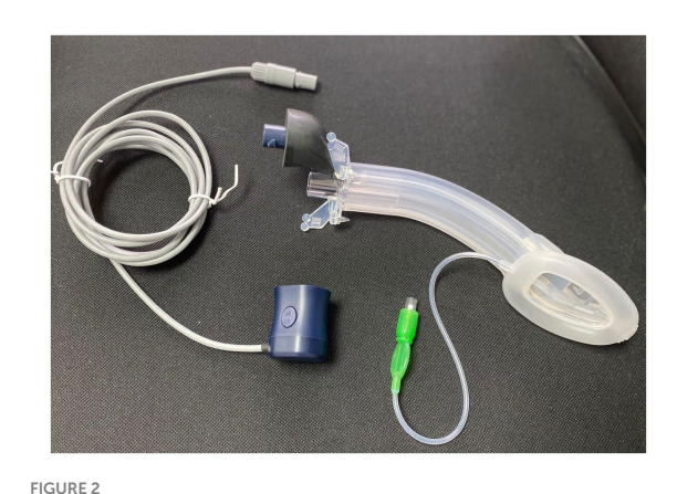
Vision mask size 3 with connection.

The Brimacombe score is decided as follows: