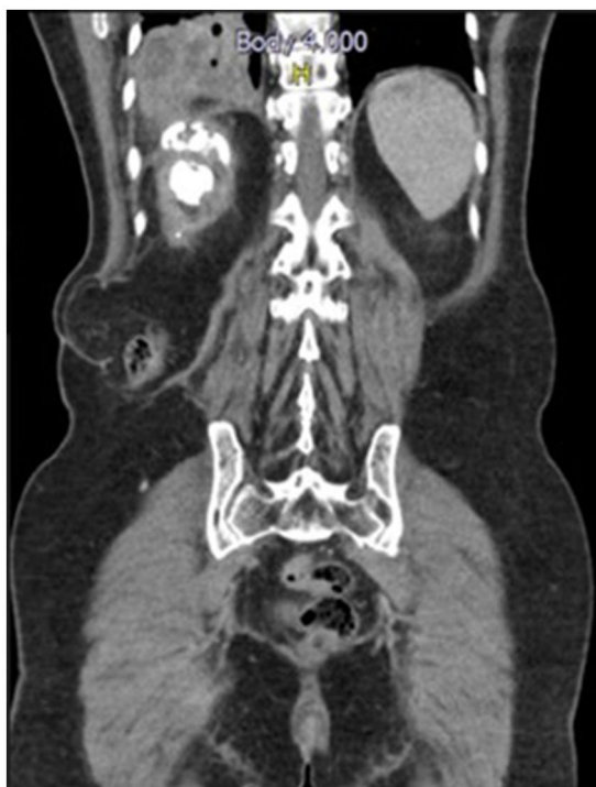
FIGURE 2 CT scan of the abdomen and pelvis with soft tissue contrast window sagittal view shows a coralliform calculus occupying all the right renal collectors with active fistula between the upper collector and the right basal lung parenchyma.

hemodialysis. Elevated bilirubin levels, progressive respiratory compromise, and severe metabolic acidosis were identified and treated with insulin and bicarbonate infusion. In addition, the patient developed bleeding from the surgical wound, as well as at the nasogastric and vaginal sites, leading to a decrease in hemoglobin levels to 4g/dL. In this state, the patient showed a slight prolongation in laboratory coagulation times and international normalized ratio (INR). The platelet count was at the lower limit of normal, and there was no evidence of fibrinogen consumption, thus not meeting the criteria for disseminated intravascular coagulation.