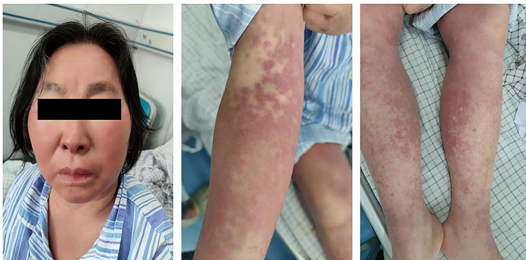
FIGURE 2 Facial edema and generalized (face, limbs, and chest) skin rash in our patient.

To further understand the clinical features and diagnosis and treatment of DiHS due to piperacillin-tazobactam. We searched the relevant articles of the PubMed database from March 1980 to September 2023, using "Piperacillin-tazobactam, Drug-Induced Hypersensitivity Syndrome (DiHS), Drug Reaction With Eosinophilia And Systemic Symptoms (DRESS)" as the search terms, and five articles were included. A total of 17 patients were eligible for DiHS caused by piperacillin-tazobactam. The general information, clinical symptoms, laboratory results, and outcomes of the 17 patients and our patient were summarized (Table 1). After analyzing the case data, we found the same proportion of men and women. The mean age was 52.94 years, ranging from 4 to 83 years, with nine patients over the age