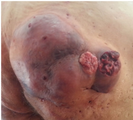
FIGURE 1 Clinical aspect of the tumors on the right buttock.