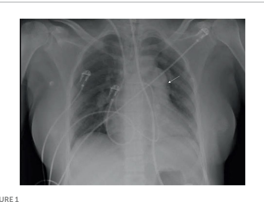
Chest radiography performed after intensive care unit admission. A large left central pulmonary artery with obliteration of the aortopulmonary window (white arrow).

pleuropericardial effusion (Figure 2). The electrocardiogram showed sinus tachycardia with right-axis deviation and a high P-wave in leads II, III, and V3–V5. A transthoracic echocardiogram (TTE) showed a left ventricle with an ejection fraction of 55% and a normal left morphology. There was severe dilatation of the RV with reduced systolic function; the systolic excursion of the tricuspid annular plane was 16 mm, and the RV S-wave was 10 cm/s. The estimated systolic pulmonary artery pressure was 93 mmHg. Transthoracic contrast echocardiography showed early positive contrast and confirmed PFO (Figure 3). There was no evidence for congenital heart disease. The patient was transferred to the ICU for the management of severe hypoxemia.