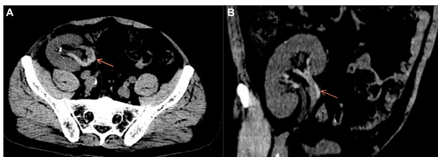
FIGURE 1 Axial (A) and coronal (B) pelvic CT scan showed increased vascular density in the transplanted kidney.

Kidney transplantation is the most effective treatment for chronic end-stage renal disease. However, with the increasing demand of