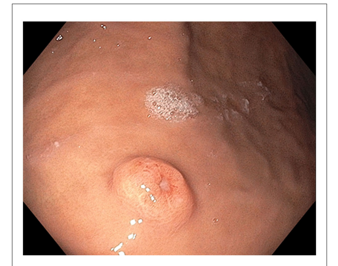
Stomach polyp: Single non-melanotic, 12 mm in diameter and 2.5 mm in height, sessile umbilicated polyp (equivalent to a Paris-1s classification of colonic polyps) found on the gastric body.