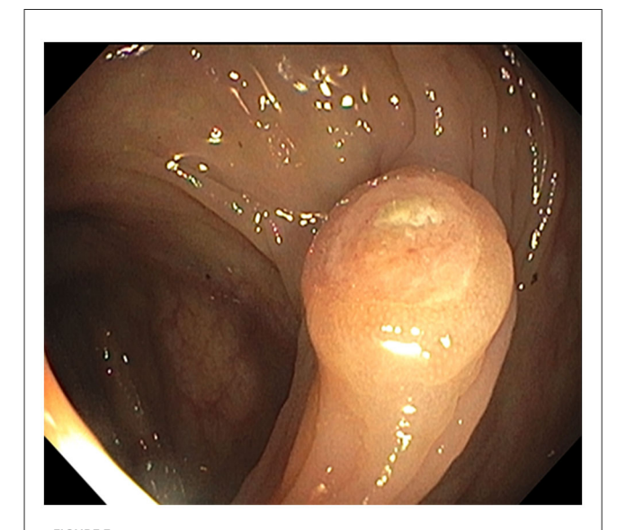
Hepatic flexure polyp: endoscopic appearance of the non-melanotic, 12 mm in diameter and 3 mm in height, sessile umbilicated polyp (Paris-1s classification of colonic polyps).

BRAF, PTEN, and TERT mutations were present in his melanoma metastases. Half of cutaneous melanomas have BRAF mutations, and the most common V600E mutation