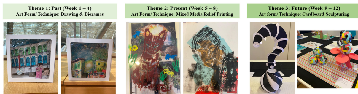
FIGURE 4 Samples of participants' artworks.

program. The artworks used in the Singapore A-Health Intervention were paintings and sculptures by several key Singapore artists from the museum's permanent collection (DBS Singapore Gallery). The decision to involve a range of representational and abstract art works was informed by the envisioned learning value of the program, aiming to expose participants to less familiar art forms and broaden their artistic horizons.