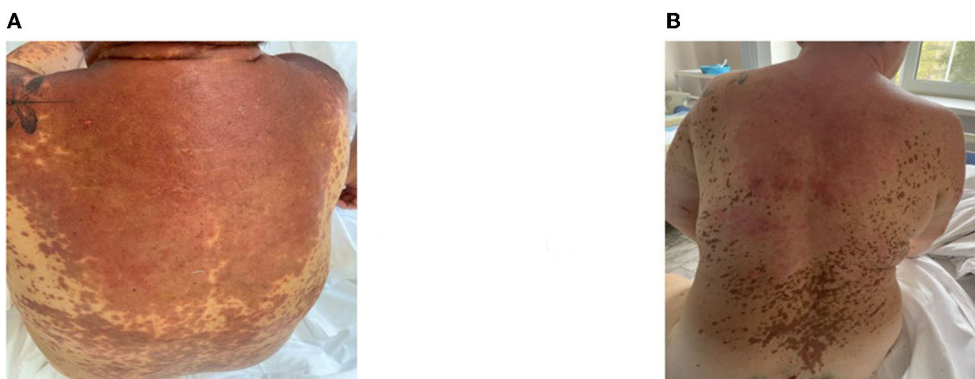
FIGURE 3 Skin process dynamics. (A) On the day of etanercept administration, multiple erosive areas with confluent erythematous rashes on the back were observed. (B) On day 11, we observed epithelialized previously erosive areas and foci of depigmentation in previously affected areas.