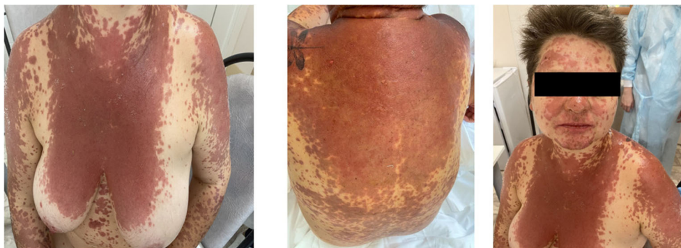
FIGURE 1 Progressing skin lesions on day 5 of hospitalization.

According to the patient's history, she had been taking etoricoxib 60 mg/day for 10 days as an analgesic before noticing a sore throat, painful swallowing, and a papular rash in the neck area. The next day, the patient discontinued the treatment on her own. On day 3, the rash spread to the upper extremities (forearms and hands), painful erosions appeared in the oral cavity, and the body temperature increased to 38.0°C. Prior to hospitalization,