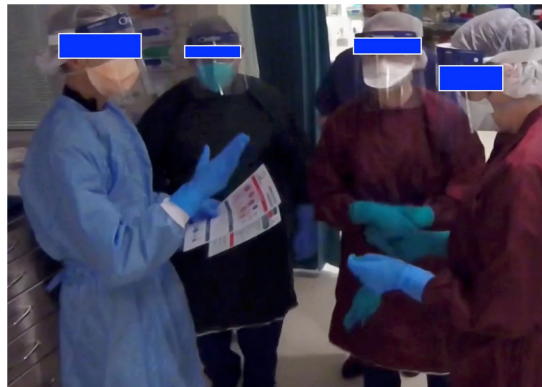
FIGURE 4 Role allocation occurring during clip 2 (referred to in quote 19).