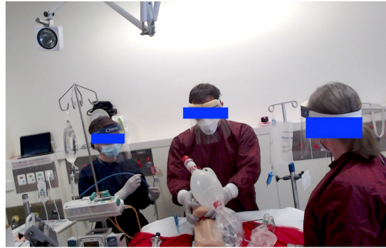
FIGURE 3 Photo of simulated procedure by group 4 (From left to right: N11, D8, D7).