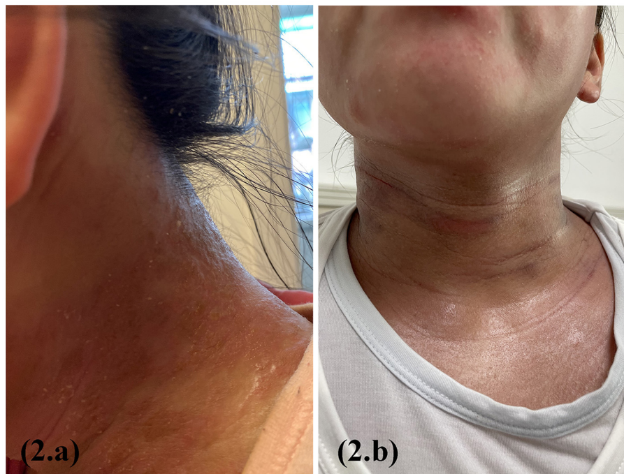
FIGURE 2 Erythema on the face and neck worsened on the second day after each dupilumab treatment (a); 6 weeks after dupilumab discontinuation and supportive therapy (b).

Dupilumab is associated with a reduced risk of serious or severe infections and non-herpetic skin infections and does not increase overall infection rates compared to placebo in patients with moderate-to-severe AD (9). In this report, the skin lesions on the trunk and extremities significantly improved after dupilumab treatment, but the neck lesions aggravated, and Staphylococcus aureus infection occurred. Considering that paradoxical erythema only occurs in a typical neck distribution, we should consider Malassezia furfur -associated neck dermatitis, demodex-associated rosacea-like dermatosis, drug-induced photosensitivity reactions, alcohol-induced facial flushing, and allergic contact dermatitis (ACD). In our patients, fungal culture was negative, and no Demodex mites were observed under a microscope. Two patients did not consume alcohol or use photosensitizing drugs. In both clinical trials and real-world applications, the response to dupilumab treatment shows site heterogeneity, the response of skin lesions to the drug varies to some extent (10), and the efficacy of trunk and limb AD is significantly better than that of face and neck AD. Based on the above research results, Staphylococcus aureus infection can be considered an opportunistic infection caused by the colonization of Staphylococcus aureus in the poorly controlled site of AD. The aggravation of atopic dermatitis and S. aureus infection may be mutually causal, forming a vicious cycle.