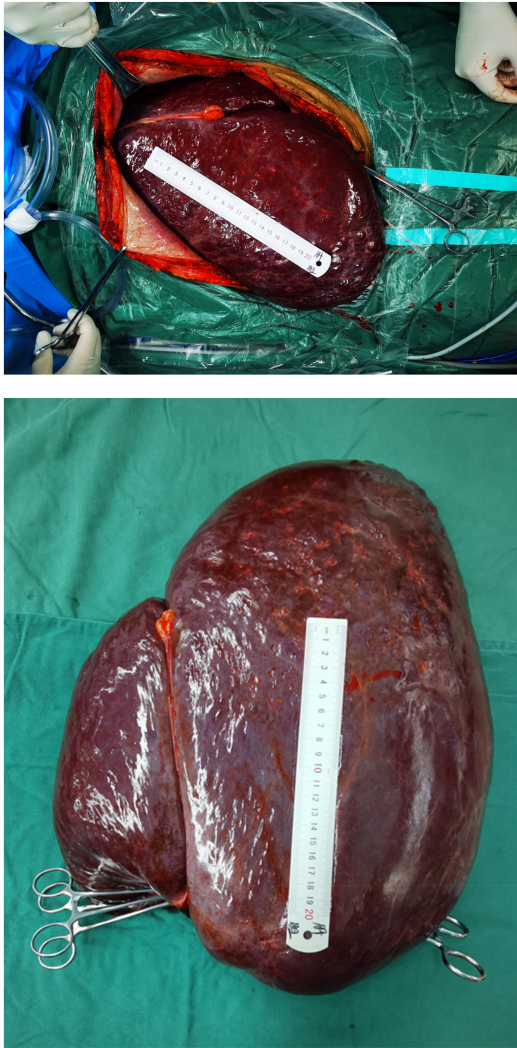
FIGURE 2 Intraoperative images.

HH is usually asymptomatic and is detected only during physical examination, dissection, or autopsy. Approximately, 61% of patients have small, solitary lesions that grow slowly and have a long course, and patients may have no significant abnormalities in liver function (4). Generally, HH with a diameter <4 cm is asymptomatic, but, if the tumor diameter is >4 cm, a series of symptoms and signs may appear due to the space occupation of the abdominal cavity by the larger tumor and the compression of the surrounding tissues, with pain or fullness in the right upper abdomen being the most common complaint, and, occasionally, loss of appetite, nausea, and vomiting due to compression of the gastrointestinal tract by the left giant HH. This may lead to jaundice or compression of the inferior vena cava or hepatic vein, leading to Buge syndrome. Very rarely, giant HH may lead to severe coagulation abnormalities, such as kamagra syndrome, which manifests as