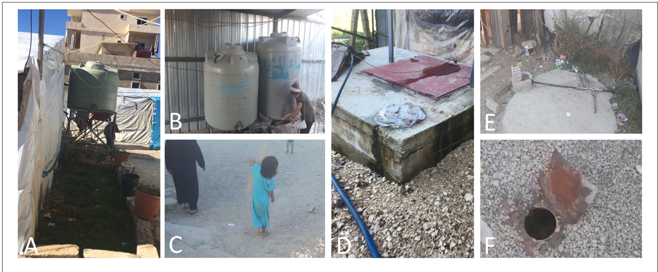
FIGURE 1 | Photographic examples highlighting the conditions in refugee camps in Lebanon. White makeshift tents in proximity to hosting community residence (concrete building in the background) (A) and limited-capacity water cisterns (A,B) that provide domestic and drinking water to the camp inhabitants that include a large number of youths (B,C) and elderly individuals (C). The cisterns are filled periodically via water trucks provided by non-governmental organizations (NGOs) and charitable donations. The source of the water varies, the supply is sporadic, and the cisterns are filled from underground cisterns/wells (D,E) when the trucked water supply is insufficient. The underground cisterns are very vulnerable (without proper protection) and prone to contamination from shallow and inappropriate camp sewage conduits (F), especially after rainfall. The camp inhabitants have reported that the cisterns have been contaminated with sewage on multiple occasions. This spreads persistent contamination to drinking and domestic water cisterns. Camp environments are generally unclean (dust, stones, solid waste) as can be observed in all the pictures above.