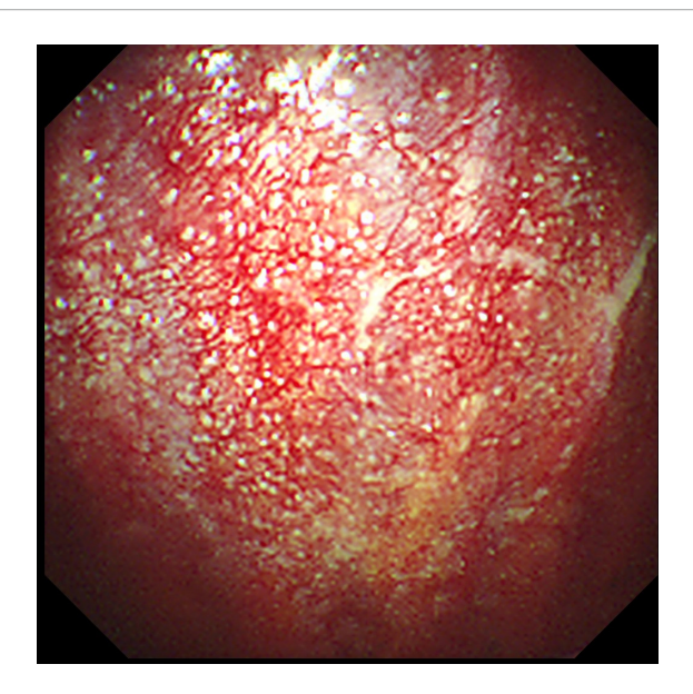
Thoracoscopy demonstrated amounts of white nodules on the pleurae.

treatment of sarcoidosis and also the most commonly used first-line therapy (17). Corticosteroids hamper the formation of granulomas and, as a result, are largely efficient against most active clinical manifestations (18). For recurrent or symptomatic patients of sarcoidosis with pleural involvement, corticosteroids are required (19). Asymptomatic pleural effusions are likely to resolve spontaneously. The time of spontaneous resolution ranges from 1 to 3 months (19). Our case responded well to oral corticosteroid therapy, resulting in marked improvement in both symptoms and chest radiological findings. Sarcoidosis