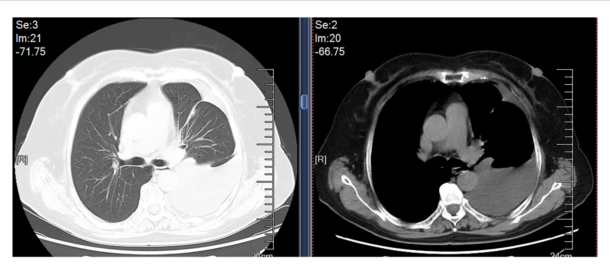
FIGURE 1 Chest CT scan showed left pleural effusions and linear opacity