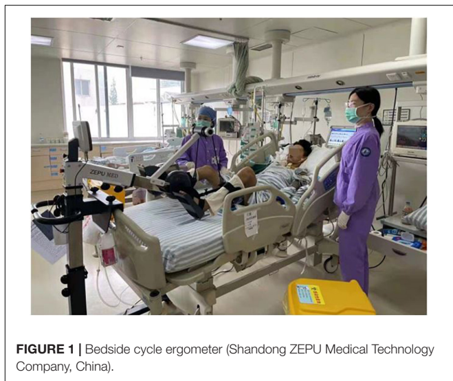
FIGURE 1 | Bedside cycle ergometer (Shandong ZEPU Medical Technology Company, China).

Two attending intensivists blinded to group allocation and intervention provision collected these variables. This was a team of researchers.