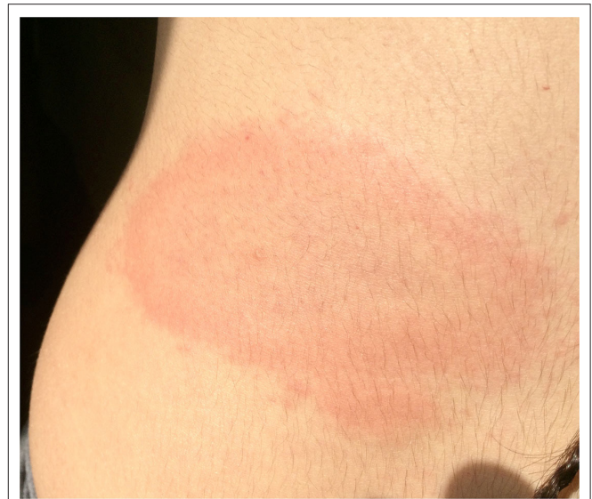
FIGURE 1 | Erythema migrans of the back developed in the first trimester of pregnancy (Case 7).

In addition to the Lyme group Borreliae , Ixodes ticks can also transmit another type of Borrelia , named Borrelia miyamotoi , which is a member of the relapsing fever (RF) group. For RF Borreliae the transmission in pregnancy as well as fetal