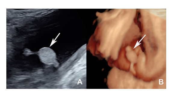
FIGURE 1 (A) Two-dimensional ultrasound showed a hyperechoic mass resembling a scrotum (the white arrow shows) in the perineum of the fetus. (B) Three-dimensional ultrasound showed the scrotum-like masses (the white arrow shows) and their relationship with other organs vividly at 33 weeks gestation.

and removed at the same time. Rectal duplication cysts are rare (only 4%) among the congenital gastrointestinal cysts (4), which are described as congenital spherical or tubular cysts located in the presacral space (5).