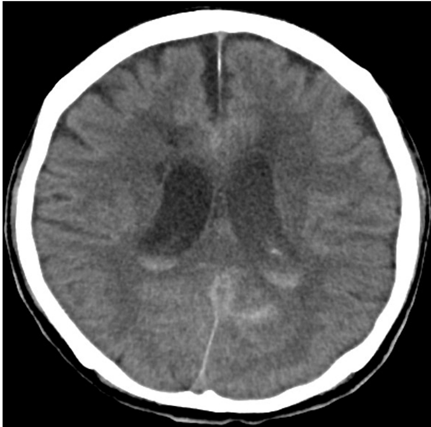
FIGURE 2 Computed tomography brain showing intraventricular extension leading to hydrocephalus.

continued to be clinically septic with multiple spikes of the temperature of above 39.5°C. However, it was found the serum lactate was persistently within the range of 2.0–4.3 mmol/L, suggestive of ongoing sepsis; furthermore, other septic parameters such as procalcitonin and C-reactive protein (CRP) did not improve despite antibiotics (Table 1). The consciousness level also worsened during this episode of sepsis with a fluctuating GCS between 7 and 10. A full septic workup including a cerebral spinal fluid (CSF) culture was taken from the indwelling catheter of the EVD and was found to be positive for a P. putida , sensitive to ceftazidime with a minimum inhibitory concentration (MIC) of 1.5.