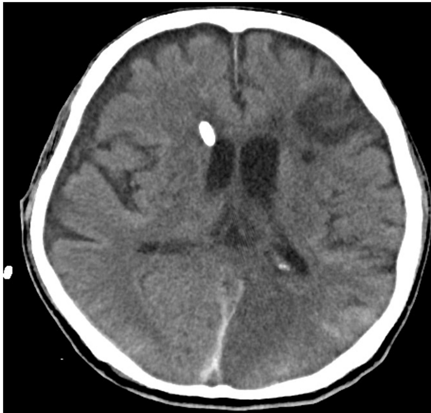
FIGURE 3 Computed tomography brain with EVD traversing through the right lateral ventricle with reduction of hydrocephalus.