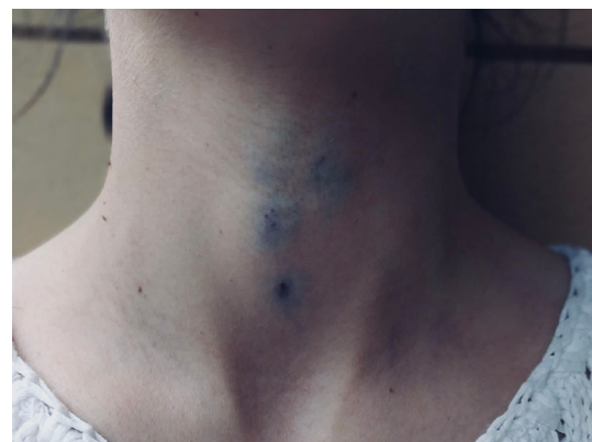
FIGURE 1 Collateral varicose venous circulation of the neck due to the presence of internal jugular agenesis.