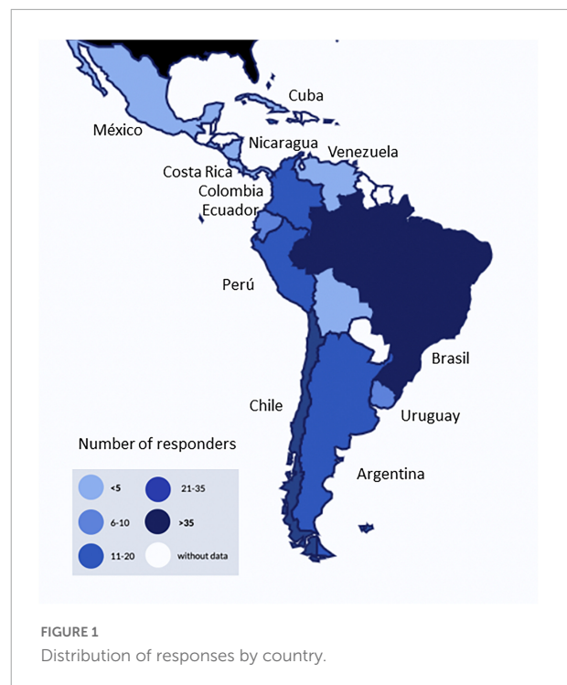
FIGURE 1 Distribution of responses by country.

The main interventions carried out within each unit were active mobilization (90.5%), followed by passive mobilization (85.0%), manual and instrumental techniques for drainage of mucus secretion (81.8%), and positioning techniques (81%) (see Table 1).