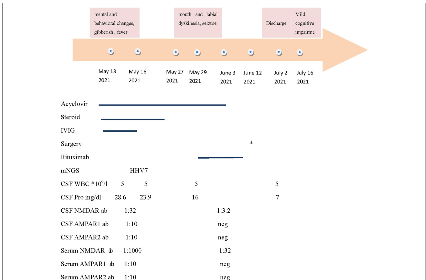
FIGURE 1 | The summary of the clinical features, therapy, and antibody titers. NMDAR: N-methyl-Daspartate receptor; AMPAR: alpha-amino-3-hydroxy-5-methyl-4-isoxazolepropionic acid receptor; CSF: cerebrospinal fluid; and IVIG: intravenous immunoglobulin. * The patient underwent laparoscopic partial ovariectomy on June 12. Neg: negative.

Neurological exams on admission showed delirium, aphasia, extensor toe response, and Kernig’s sign with the right side. Brain MRI revealed a fluid attenuation inversion recover (FLAIR) high-intensity lesion involving the mesial temporal lobes and the hippocampus on May 13, 2021 (Figure 2). Electroencephalogram (EEG) revealed a diffused slow wave. A lumbar puncture was performed on May 14, and the cerebrospinal fluid (CSF) analysis revealed a white blood count of 5 \times 10^6/L , protein of 28.6