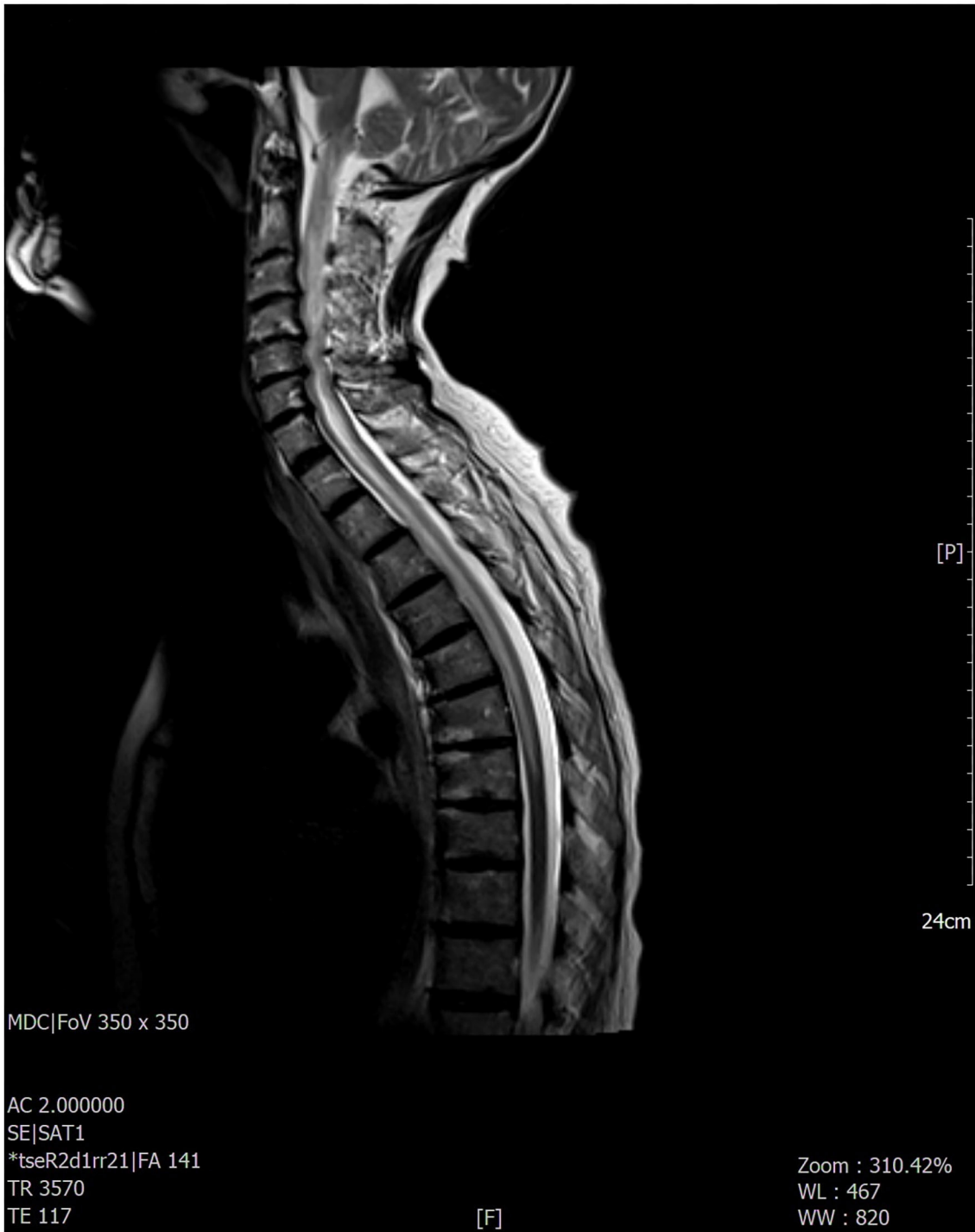
FIGURE 3 | The most significant findings were found at the level of the cervico-dorsal cord with evidence, in the T2-weighted sequences, of extended signal hyperintensity which mainly concerned the central component as best evident in the axial acquisition.

median age 61). Interestingly, seven out of nine patients with lung adenocarcinoma presented with NMOSD as the first manifestation of cancer. Other relevant information can be found in Table 1 .