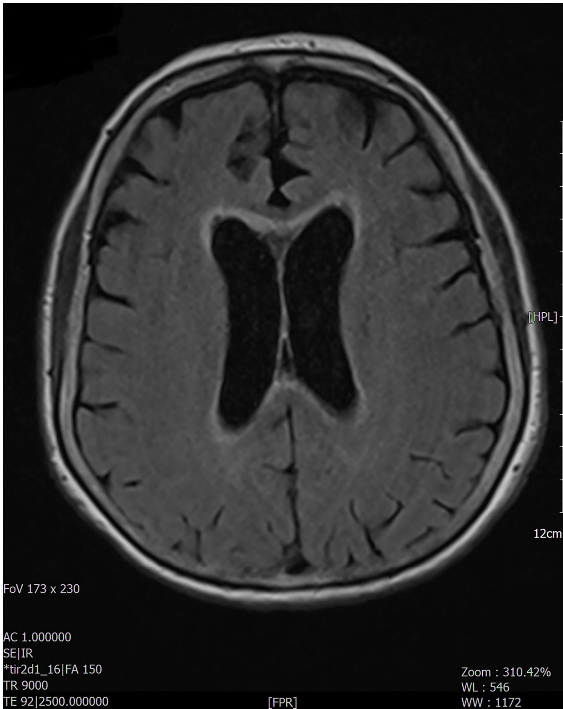
FIGURE 1 | The MRI examination documented the presence, at the level of the brain, of hyperintense alteration, in FLAIR images, involving the anterior portion of the corpus callosum and the peri-ependymal white matter at the level of the lateral ventricles. The remaining brain areas of greater expression of aquaporin 4 (diencephalon, midbrain, a pons) did not appear to be affected.

comprehensive literature search for all types of cancers associated with NMOSD (16). The authors described 62 cases that met the Paraneoplastic Neurologic Syndromes (PNS) Euro network criteria (17). NMOSD preceded cancer diagnosis only in 19/62