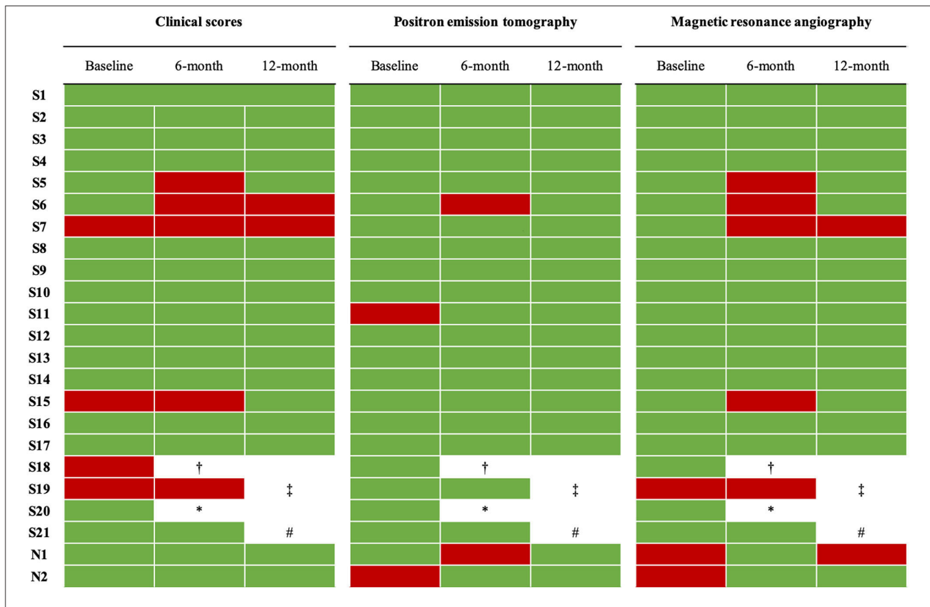
FIGURE 2 | Disease activity of enrolled patients according to clinical scores and imaging parameters at baseline and at 6-month and 12-month evaluations. Clinical scores were ITAS-2020, ITAS-CRP, ITAS-ESR. According to clinical scores, Takayasu arteritis was defined active if at least one of the following conditions was present: ITAS2020 \geq 2 , ITAS-ESR \geq 3 , or ITAS-CRP \geq 3 . Green, disease not active. Red, disease active. †switched to a different bDMARD at month 2 due to a clinical relapse while on the highest allowed dose of infliximab. ‡switched to a different bDMARD at month 6 due to persistence of disease activity while on the highest allowed dose of infliximab. *voluntarily dropped out of the study and lost to follow-up at month 3. #excluded from the study after she expressed a desire for pregnancy.

12 patients (65%) experienced grade 2 adverse events related to the ongoing therapy. Specifically, upper airway infection ( n = 7 ), herpes simplex reactivation ( n = 4 ), vaginal candidiasis ( n = 1 ). These events required neither hospitalization nor a modification of IFX-B therapy.