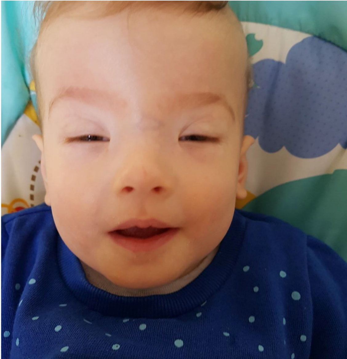
FIGURE 1 | The facial phenotype of Case 1 at 11 months. Note the significant short palpebral fissures, ptosis, epicanthic folds and high forehead with flat, broad nasal bridge.

months and started walking at the age of 2 years. He does not speak; however, according to his parents, he understands speech.