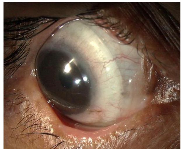
FIGURE 1 | Scleral lenses [prosthetic replacement of ocular surface ecosystem (PROSE) lenses] used for management of severe dry eye in a patient with chronic ocular sequelae post Stevens-Johnson syndrome/toxic epidermal necrolysis.

Subsequent studies from India by Basu et al. and Shanbhag et al. studied the natural history of LRK due to LMK and noted that definitive therapy in the form of MMG and PROSE lenses significantly improve BCVA and prevent development or progression of LRK when compared to conservative therapy in the form of topical medications (6, 7). A combination of MMG and PROSE lenses helped in maintaining and improving BCVA