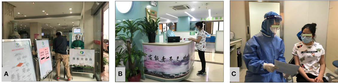
FIGURE 2 | Three-level pre-screening and triage. (A) Level 1 lobby triage. (B) Level 2 clinic front desk triage. (C) Level 3 consultation space triage.

Furthermore, dental chairs should be set up in well-ventilated consultation rooms with air sterilization equipment (3, 38). The measures for performing dental practice during periods of different risk levels are as follows: