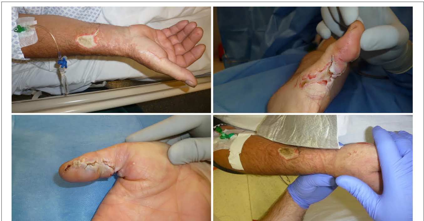
FIGURE 3 | Low-Voltage entry wounds. Various presentations of entry marks of low voltage injuries, which show second to third degree burns. Here, surgical treatment and split skin grafts are often required for treatment. Such entry marks are generally believed to be a risk factor for secondary complications following electric injuries.