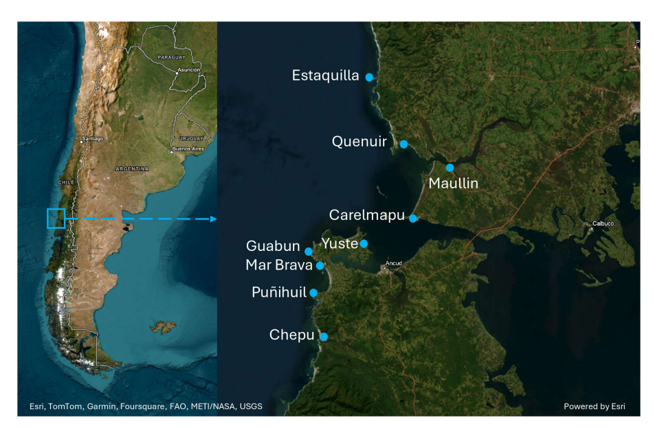
FIGURE 1 Main TURFs locations (blue circles) where interviews with local actors were conducted in Los Lagos region, Chile.

Vallejos et al. 10.3389/fmars.2024.1516781