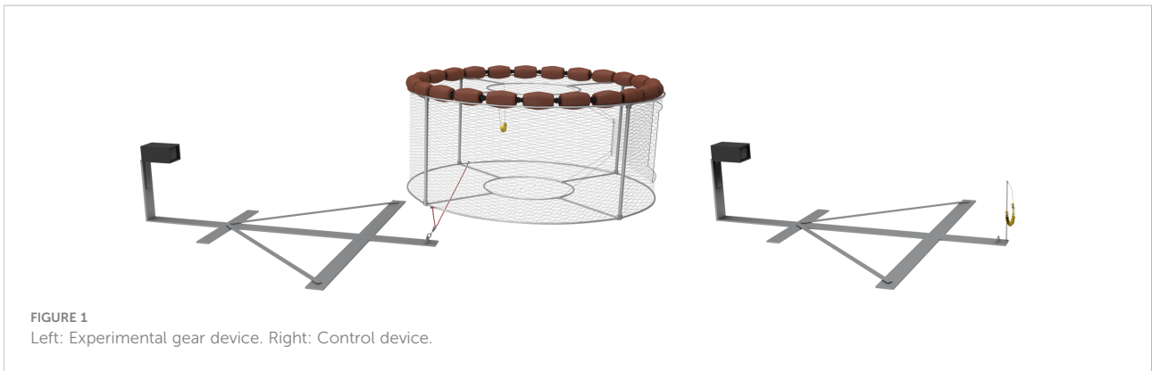
FIGURE 1 Left: Experimental gear device. Right: Control device.

current direction (Furevik and Løkkeborg, 1994). Fish being attracted by odor plume (Løkkeborg, 1998), most of their approaches to the bait is likely to be up-stream. Furthermore, floating the pot avoids the catch of crustaceans such as red king crab ( Paralithodes camtschaticus ) and allows targeting fish species exclusively (Furevik et al., 2008). This characteristic supports the regional legislation, which prohibits the catch of crustacean while using fish pots (CRPMEM Bretagne, 2018). This experiment aims to comply with that legislation. The floated gear was thus linked up to the metal frame using a swivel 40cm above the sea floor, allowing for gyration, whereas