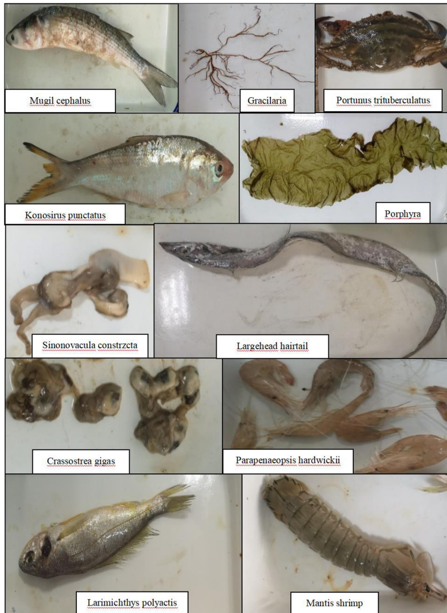
FIGURE 2 | Specimens of the marine organism sampled in this study.

adults (Sv). For calculation of the committed effective dose for ingestion of marine organisms in this study, the ingestion rate was assumed as exact ingestion rates were not available. Here, the mean per capita consumption rate of aquatic products in China (50.97 kg/year) in 2018 was used to estimate the committed effective dose (FAOSTAT, 2018). This was calculated by multiplying the radionuclide activity in the marine organism (Bq/kg freshweight ) by the ingested mass (kg) and the DC (Sv/Bq) (ICRP, 2012).