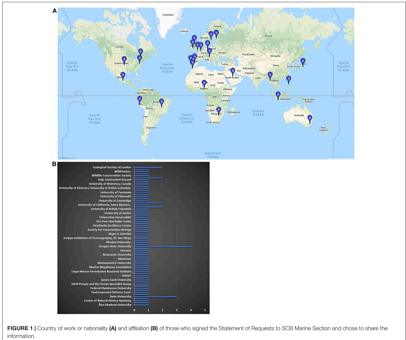
FIGURE 1 | Country of work or nationality (A) and affiliation (B) of those who signed the Statement of Requests to SCB Marine Section and chose to share the information.