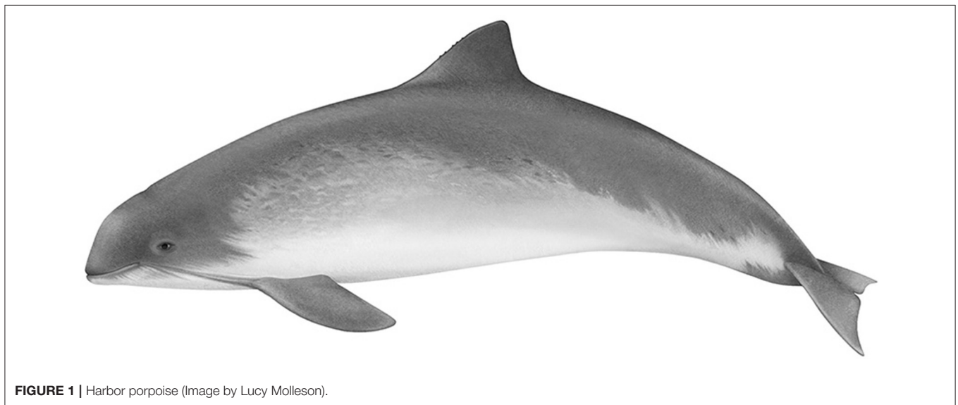
FIGURE 1 | Harbor porpoise (Image by Lucy Molleson).

**For a full explanation of Red List Criteria see IUCN (2012).