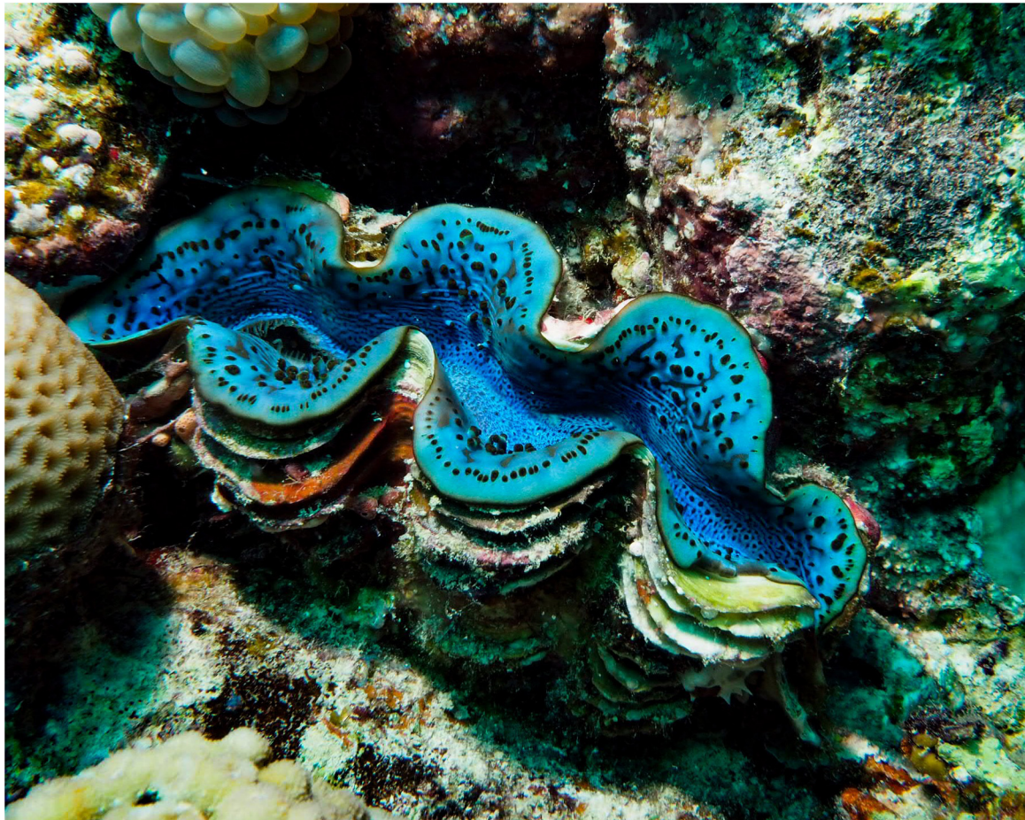
FIGURE 1 | Red Sea Tridacna maxima with its mantle exposed.

datasets consisted were T. maxima from previous studies conducted in the Red Sea. Alignments were translated to amino acids in MEGA 7.0.14 (Kumar et al., 2016) to make sure a functional gene sequence was obtained before being used in DnaSP 5.0 (Librado and Rozas, 2009) and Arlequin v3.5 (Excoffier and Lischer, 2010) for further analyses.