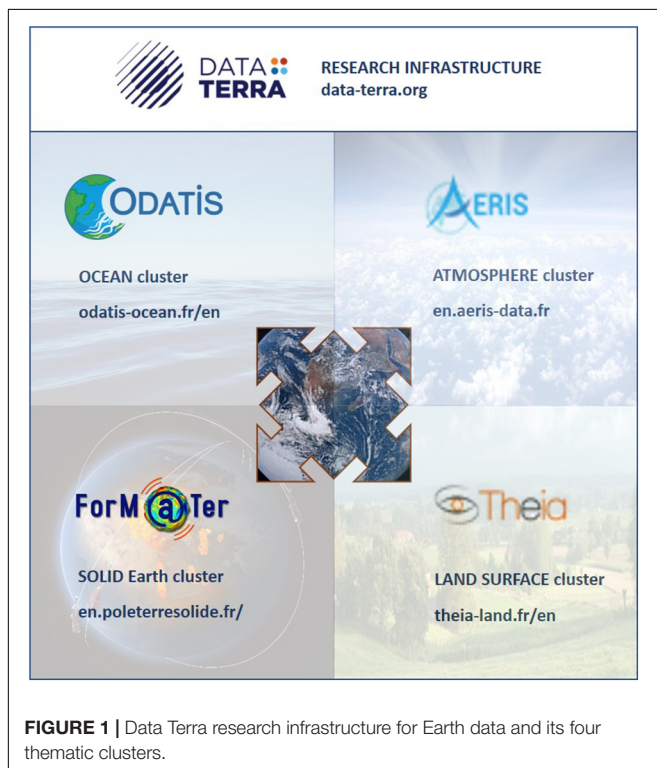
FIGURE 1 | Data Terra research infrastructure for Earth data and its four thematic clusters.

Terra also serves the international community through satellite missions, international monitoring networks, and partnerships for development.