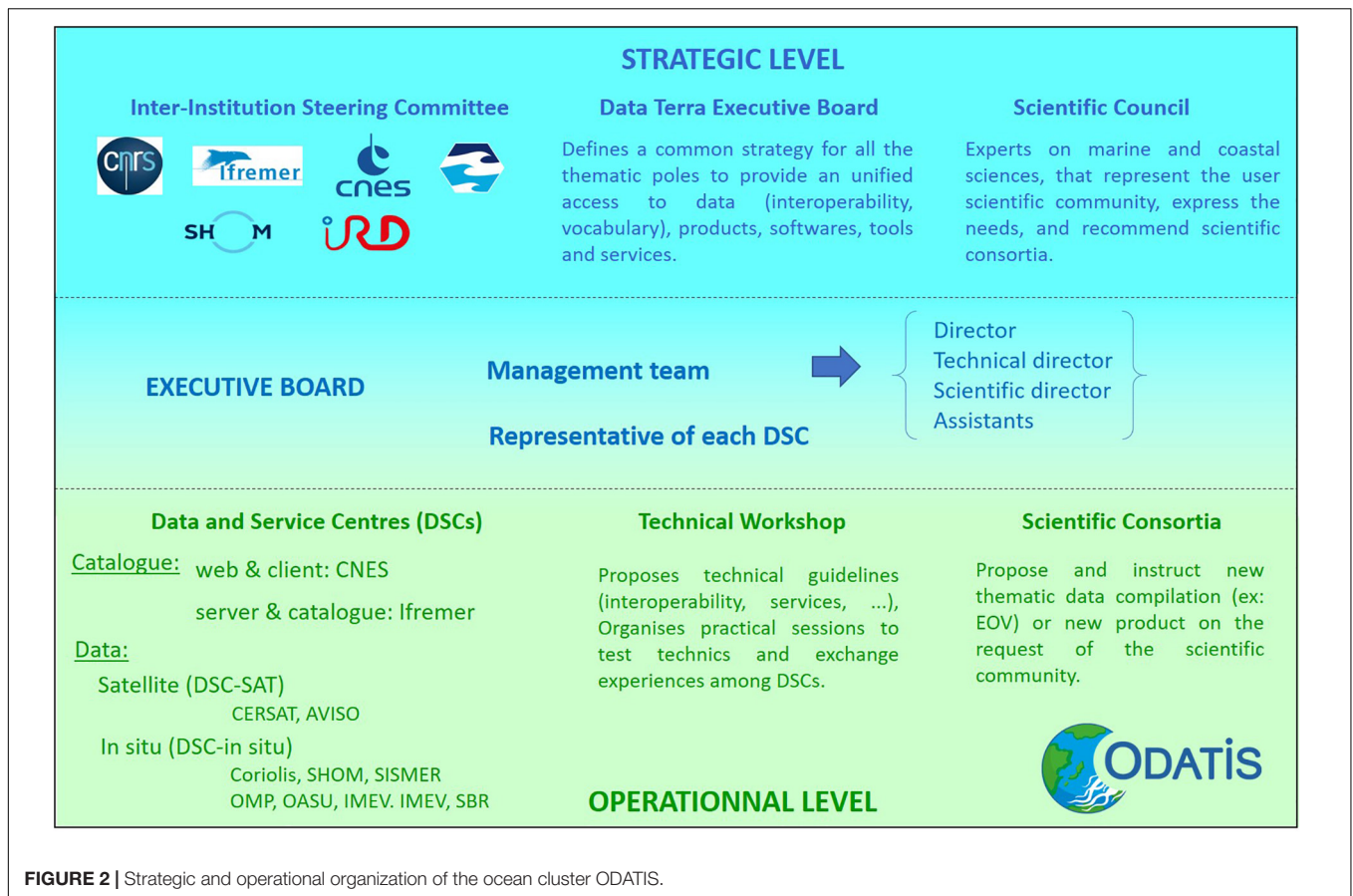
FIGURE 2 | Strategic and operational organization of the ocean cluster ODATIS.

EMODnet thematic lots (Miguez et al., 2019) 8 , the marine component of the EOSC-HUB (Marine Competence Centre).