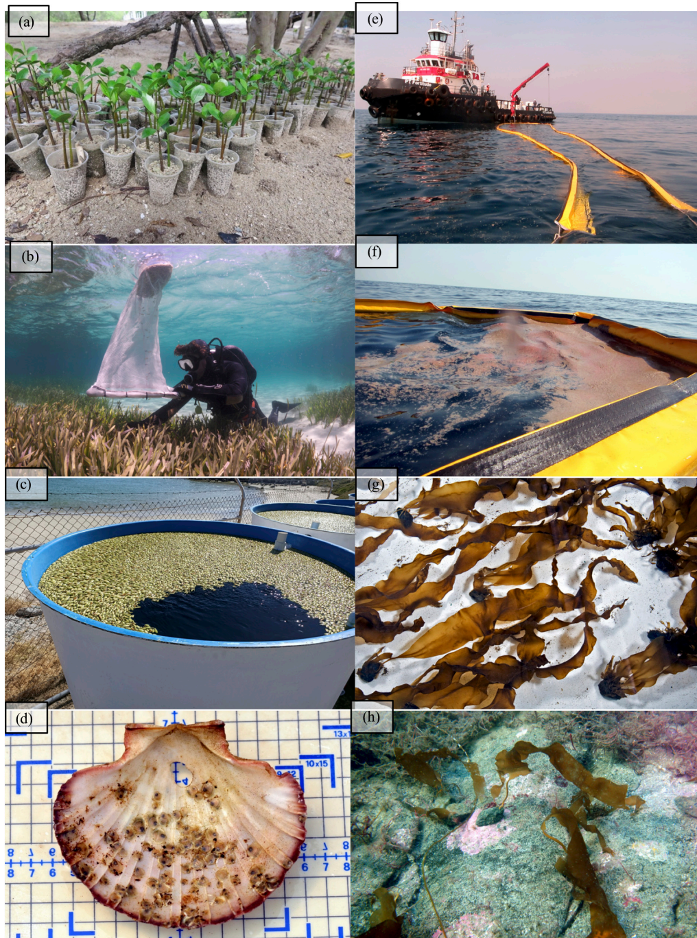
FIGURE 2 | Examples of how propagules are prepared for restoration: (a) Viviparous seedlings of Rhizophora grown in plastic pots prior to planting; (b) collection and (c) preparation in tanks of Posidonia australis fruit; (d) flat oyster ( Ostrea angasi ) spat attached to an empty shell for deployment; (e,f) collection of coral spawn using an oil boom; (g) young sporophytes of kelp ( Saccharina latissima ) seeded onto small rocks ("green gravel") in the laboratory and (h) sporophytes outplanted to a rocky reef.

of marshes by planting seedlings propagated from seeds has subsequently been achieved (Adams and Benosky, 1998). In contrast, few restoration efforts have involved direct seeding, with the best examples having been achieved for Spartina