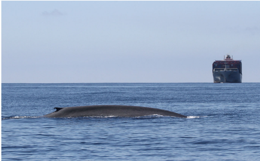
FIGURE 3 | Photo of a blue whale in front of a large vessel off California on 4 September 2014. Photo taken by John Calambokidis of Cascadia Research, as part of the diurnal ship strike risk assessment (Calambokidis et al.).