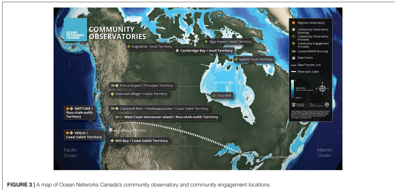
FIGURE 3 | A map of Ocean Networks Canada's community observatory and community engagement locations.

and the impact on community activities such as hunting, fishing, transportation, recreation, and other activities.