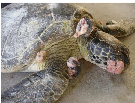
FIGURE 1 | Green turtle showing externally visible signs of fibropapillomatosis (FP). This image was shown to fishers during interviews.

This study took place over two years between November 2008 and December 2010 in the TCI, a UK Overseas Territory in the Caribbean (21°45N, 71°35W). Here, there are minor hawksbill turtle ( Eretmochelys imbricata ) and minor green turtle nesting populations (Stringell et al., 2015), yet regionally significant foraging aggregations of both species (Richardson et al., 2009). The islands have numerous creeks and shallow muddy-sand banks that offer extensive seagrass habitat ideal for foraging green turtles. The research team was stationed on South Caicos, the main fishing center of TCI, for the duration of this study. Regular visits were made to the islands of Grand Turk and Providenciales, the two main population centers, and several visits were made to North and Middle Caicos (Figure 2).