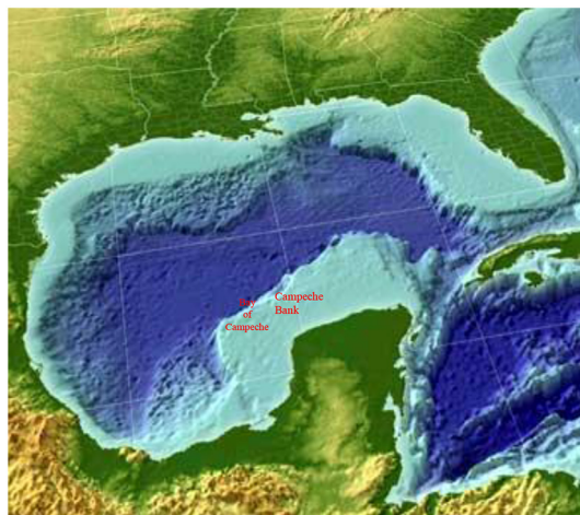
FIGURE 1 | Location of the Bay and Campeche Bank in the southwestern Gulf of Mexico (modified from Google earth).