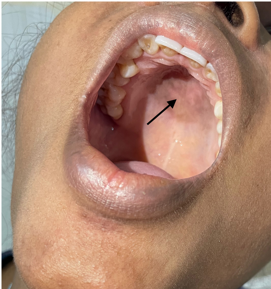
FIGURE 4 Ulcer of the hard palate.

received pulse methylprednisolone, followed by oral prednisolone and hydroxychloroquine. Her condition gradually improved, and she was discharged in stable clinical condition. A renal biopsy obtained after discharge showed class 4 lupus nephritis. The case fulfilled the ACR/EULAR 2019 criteria for the diagnosis of SLE (5) (Table 1).