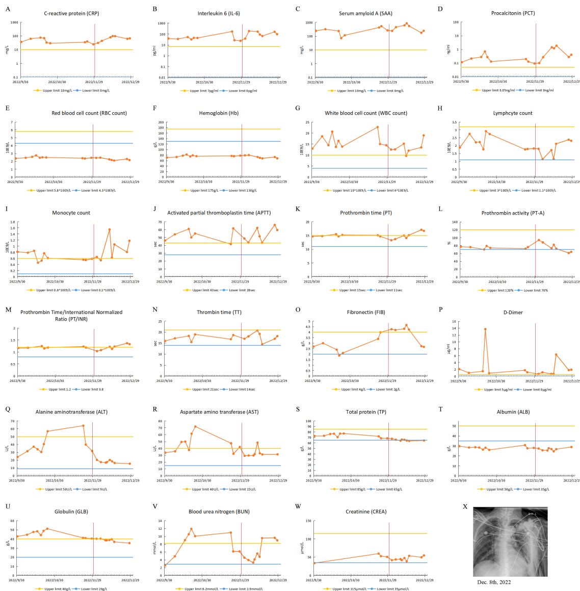
FIGURE 2 Clinical test results of case 2 from September 30, 2022, to December 31, 2022. (A–W) Test results of patient’s blood specimens. The horizontal axis represents the dates, and the solid orange dots indicate the test results at the corresponding time points. The red vertical line in the figure corresponds to November 30, 2022, when the city of Guangzhou ended closed-off management. (A–D) Infection-related test results: CRP, IL-6, PCT and SAA. (E–I) Routine blood test results: RBC, Hb, WBC, monocyte count, lymphocyte count. (J–P) Coagulation-related test results: APTT, PT, PT-A, PT/INR, TT, FIB and D-Dimer. (Q, R) Liver function-related test results: ALT and AST. (S–U) Serum protein-related test results: TP, ALB and GLB. (V, W) Renal function-related test results: BUN and CREA. (X) CXR test result.

and activate immune cells, while B cells produce antibodies that bind to bacteria, marking them for destruction through opsonized phagocytosis or complement-mediated lysis, thus limiting pathogen spread.